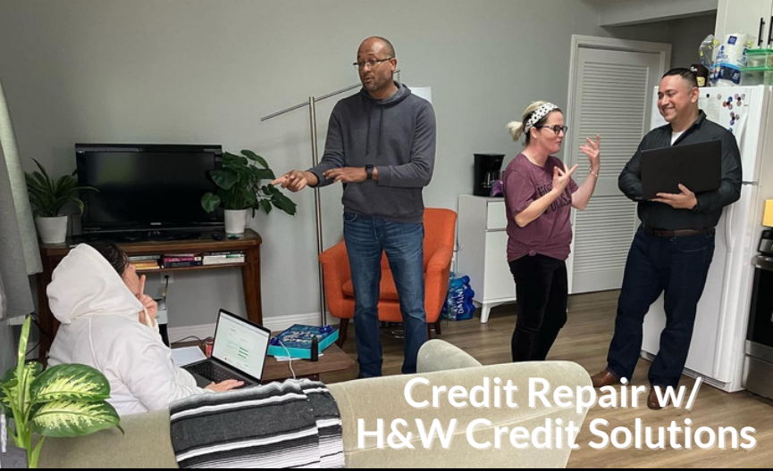
Credit Repair w/ H&W Credit Solutions