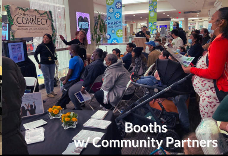
Booths w/ Community Partners