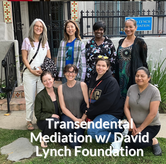
Transcendental Mediation w/ David Lynch Foundation