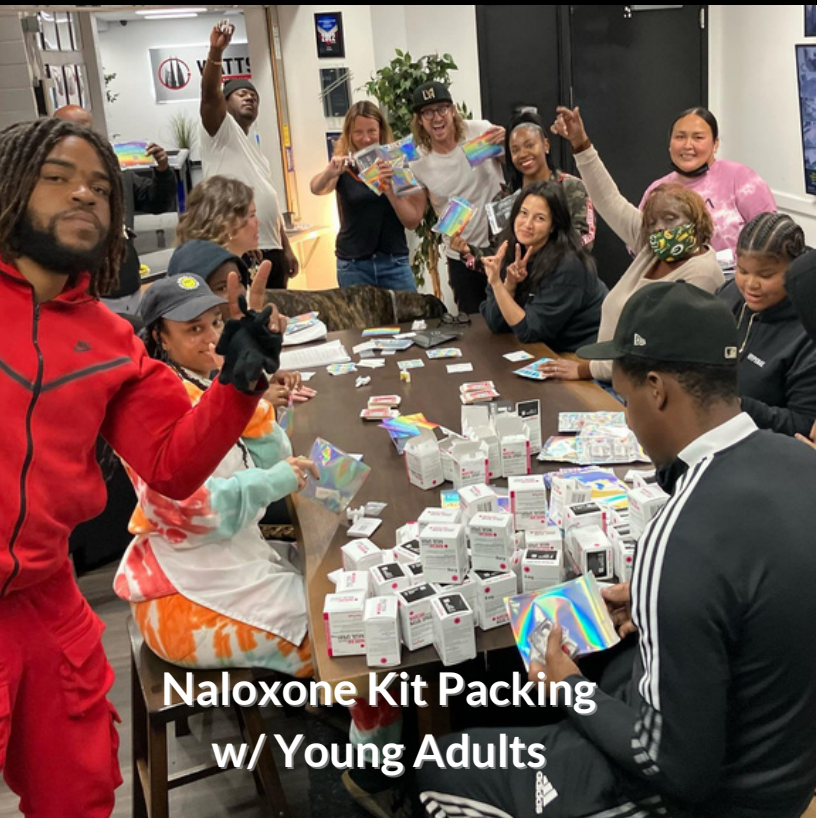
Naloxone Kit Packing w/ Young Adults