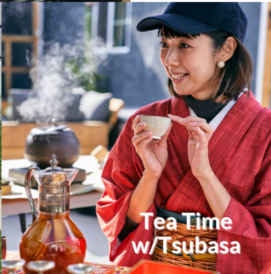
Tea Time w/ Tsubasa